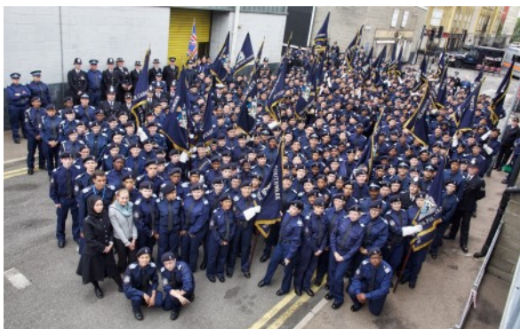
The Annual Cadet Competition