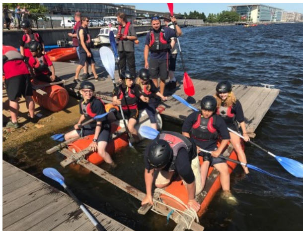
Cadets taking part in joint cadet & scout competitions

"I knew it would be a great experience and enable me to gain self confidence. I love our meetings. It's like a miniature break from the world where you can really be yourself."