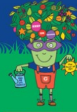
Gerty Growth Mindset