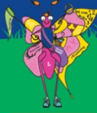
Leila Lifelong Learning